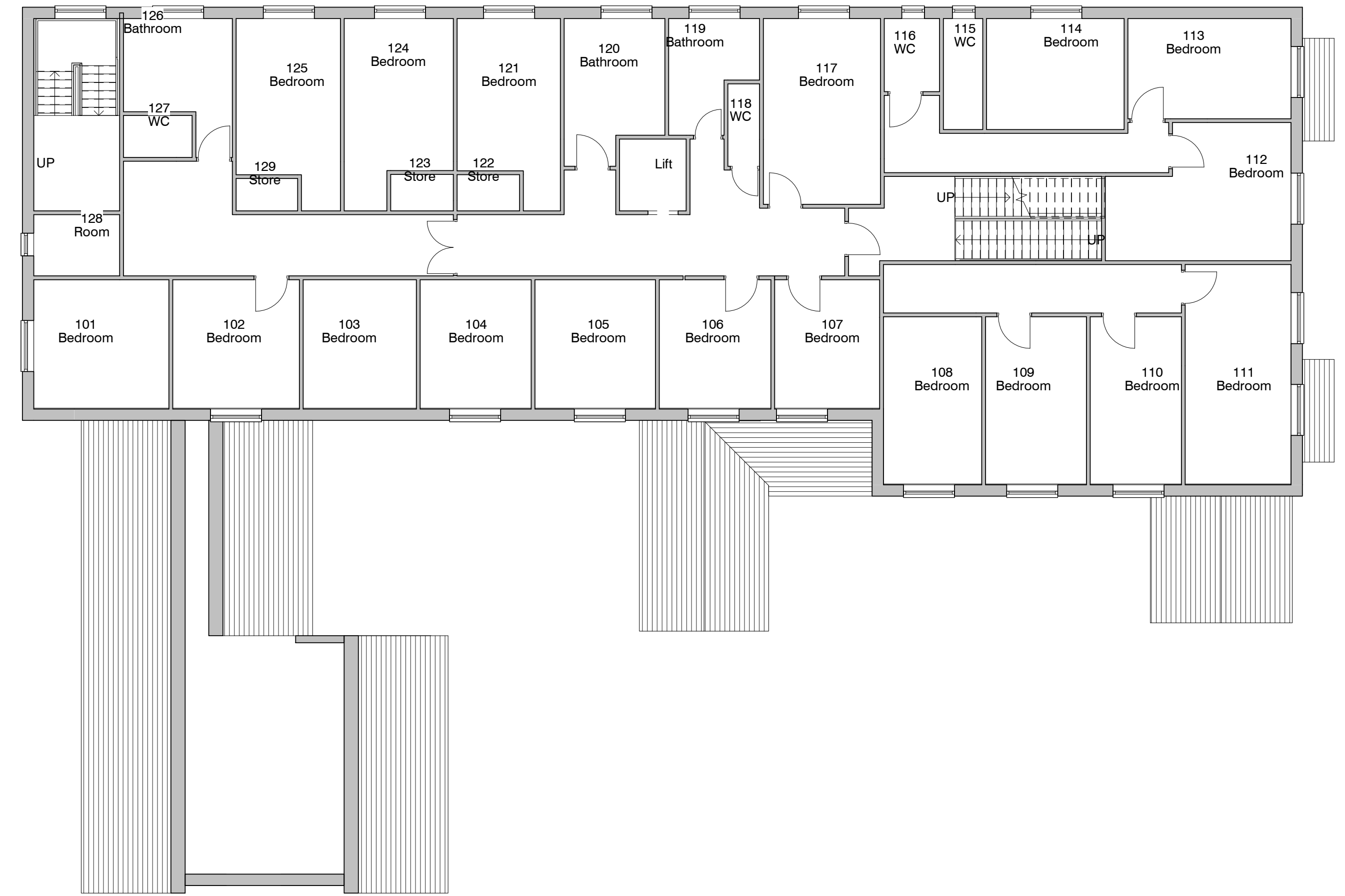
2. Level 1 - GA Existing 1 : 100