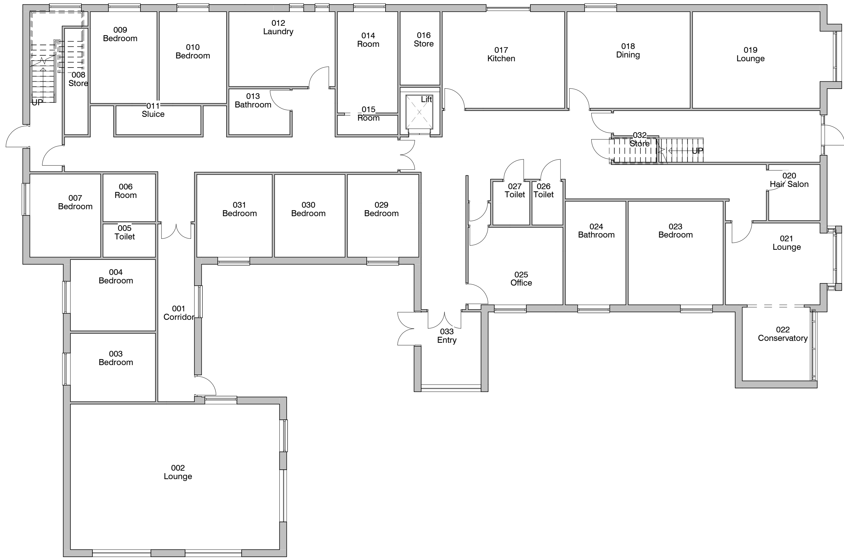
1. Level 0 - GA Existing 1 : 100